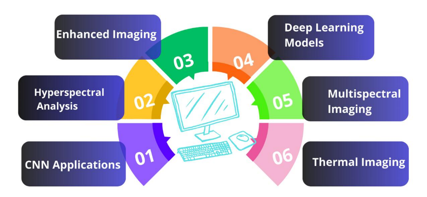
Figure: 2 showing advances in computer vision for food quality assessment

The improved imaging is complemented with improved image processing techniques to yield clearer and more usable captured images. Improved accuracy of food quality analysis is achieved by employing noise reduction algorithms, adaptive contrast enhancement and deep learning based image